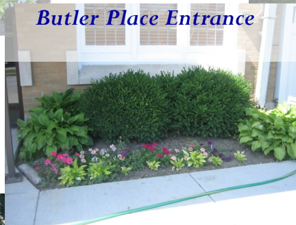
Butler Place Entrance