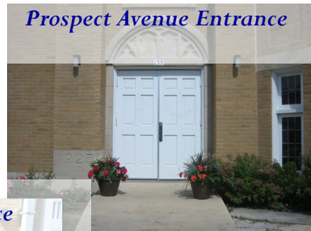
Prospect Avenue Entrance