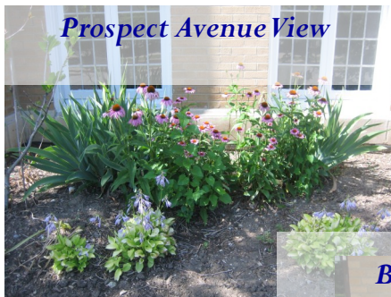
Prospect Avenue View

Below are some pictures of their beautiful work.